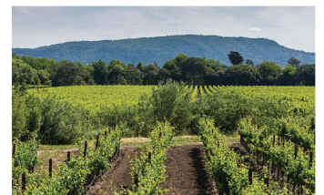
Sangiacomo Vella Vineyard Sonoma/ Carneros

Planted in 1997, Vella Vineyard is one of the Sangiacomo's biggest vineyards and was the first of their vineyards to be planted with newer French clones and rootstocks. Soils are Zamora silty loam and Wright loam. The vineyard is planted with fifteen combinations of clones and rootstocks.