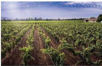
Sangiacomo Home Ranch Sonoma/ Carneros

Our Carneros Highway Chardonnay takes full advantage of five Carneros vineyards, each among the finest the appellation has to offer. Farmed by the Sangiacomo family, growers since 1904, these vineyards represents a Chardonnay resource unsurpassed anywhere in the region.