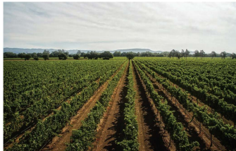
Sangiacomo Green Acres Vineyard Sonoma/ Carneros

Carneros Highway Pinot Noir Carneros Highway Chardonnay